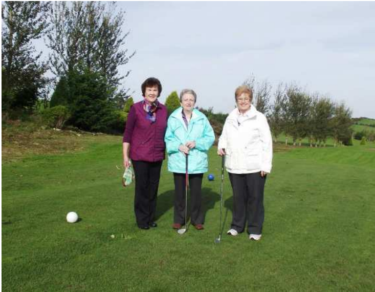
Some of the members of Newry U3A Golf Group. I am sure they will be signing up for Downpatrick!